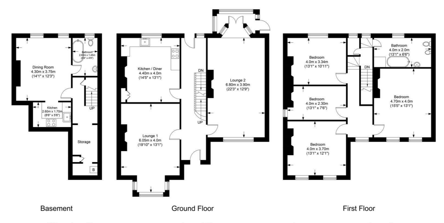
Illustration purposes only. All measurements are approximate.